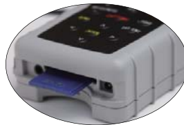
SD Card Slot